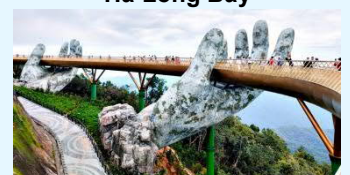
Golden Hands Bridge