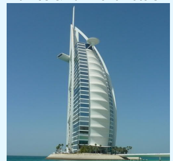
Burj Al Arab