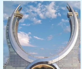
Raffles & Fairmont Hotels