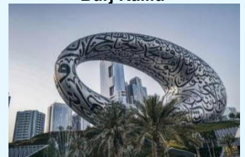
Museum of Future