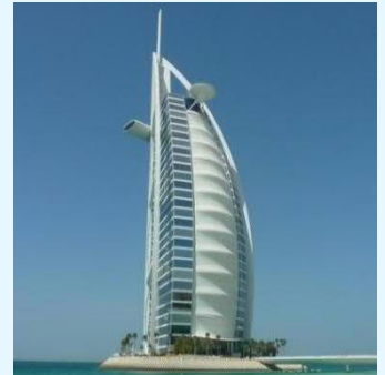
Burj Al Arab

Please contact us with your preferred dates and destinations, and we will reach out with our offer.