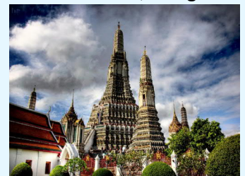
Temple of Dawn