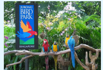
Singapore Bird Paradise