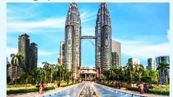
Petronas Twin Towers