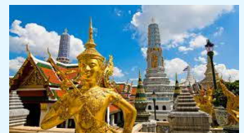
Grand Palace, Bangkok