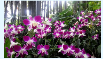
Orchids at Singapore