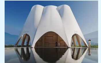
EXPO 2025 Qatar Pavilion