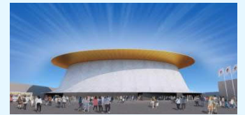
EXPO 2025 Hall