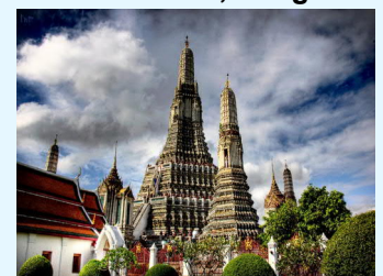
Temple of Dawn

We also offer customized tours for any city or country. Please contact us with your preferred dates and destinations, and we will reach out with our offer.