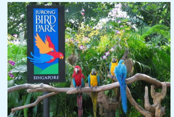
Singapore Bird Paradise