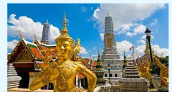
Grand Palace, Bangkok