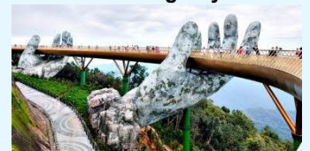
Golden Hands Bridge