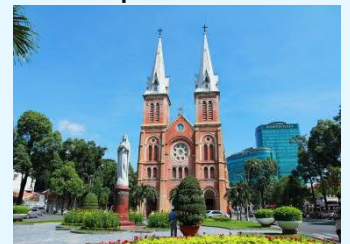
Notre Dame Cathedral