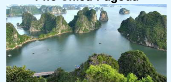
Ha Long Bay