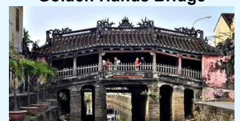
Chua Cau Bridge