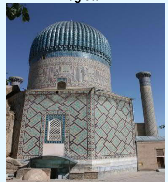
Gur Amir Mausoleum