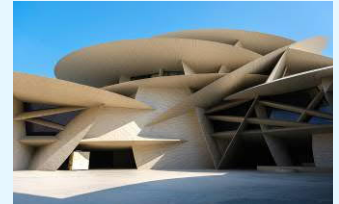
Qatar National Museum

Please contact us with your preferred dates and destinations, and we will reach out with our offer.