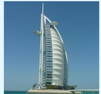
Burj Al Arab