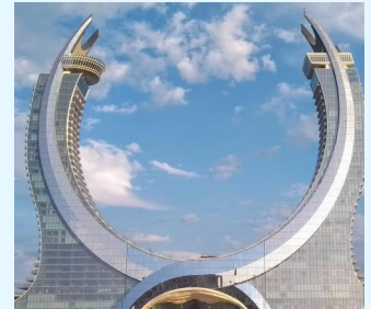
Raffles & Fairmont Hotels