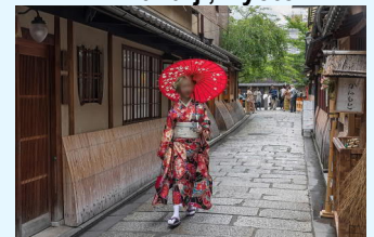
Gion Geisha District, Kyoto