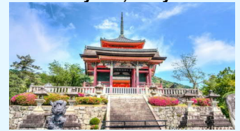
Senso-Ji Temple, Tokyo