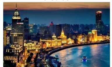
The Bund, Shanghai