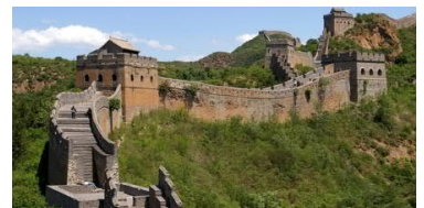
Great Wall of China