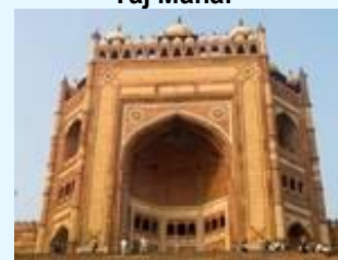
Fatehpur Sikri High Gate